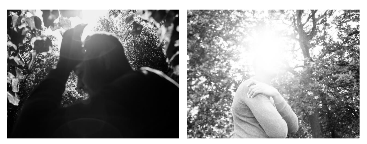
In these two photographs, one of the participants is in his local park in Glasgow – for him, the park is a place where he feels peaceful. It is part of his community, where he can pause, gain encouragement, and connect to the natural world around him.

The image below, reproduced from an online discussion board, shows some of the comments, thoughts and reflections the young people shared.